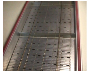
Mesh Belt Conveyor