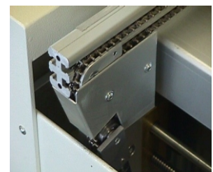
Pin & Chain Conveyor